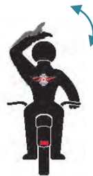
Leaving Group Tap top of helmet with an open hand (not shown in National signals)