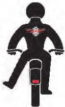
Hazard Left Extend left leg out at 45°