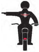
Left Turn Arm extended straight out to the left

CMC Approved Signals - Ottawa – 2014 - Here are the main signals that are used while group riding. These are used in addition to electronic signals. The Road Captain will initiate the signals and all riders will pass back the signal to ensure all riders are aware of the Road Captain's signal.