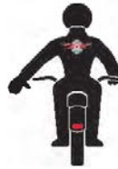
Slow Down and Stop Arm down at 45° with palm facing backwards